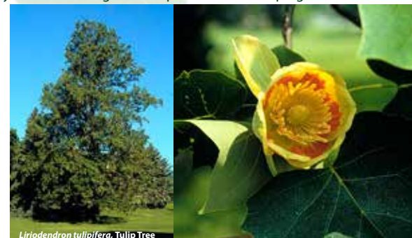
Liriodendron tulipifera, Tulip Tree

29. Tsuga canadensis 'Sargentii' (base of Great Lawn, opposite Horsebarn Hill Rd.) [G6] In the woods of Connecticut, the Eastern Hemlock can most often be found growing on north and east facing slopes, because it prefers the cooler summer temperatures found there. The species is a conical, evergreen tree to 70' tall, but the Sargent's Weeping Hemlock is a special cultivar that exhibits a distinctly pendulous habit and more limited growth. Despite its relatively small stature, this individual is actually an old and magnificent specimen of a weeping form.